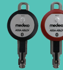
Medeco eCliq Server Lock

eCLIQ Server Locks and puck locks restrict tenant enclosure access with audit logging.