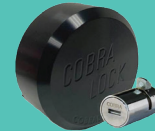
Cobra Puck Lock